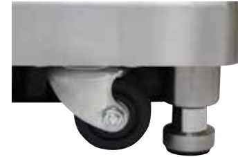
Self-leveling brakes for stability on uneven floors