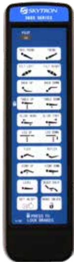
Optional Wireless Control