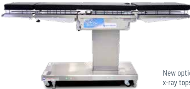
New optional tunnel style x-ray tops