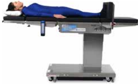
Upper Body Imaging