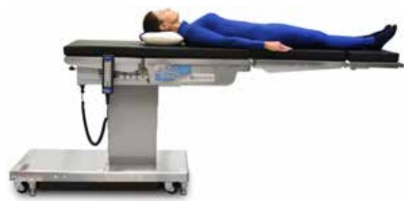
Lower Body Imaging