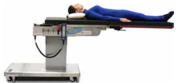
Lower Body Imaging with 40" Carbon Fiber Extension