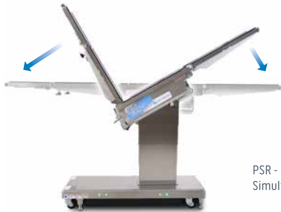
PSR - Patient Safe Return Simultaneous return to level