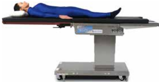
Upper Body Imaging with 40" Carbon Fiber Extension