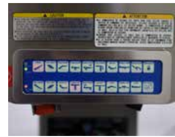
Back lit back-up controls for emergency situations