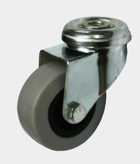
Replacement Castor Set to suit 116909 and 116910 (Set of 5) CODE: 138144