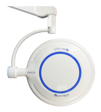
Double Yoke Maximum positioning versatility

Single Yoke Easy positioning for low ceiling heights