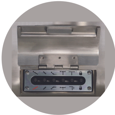
Back-up controls for emergency situations