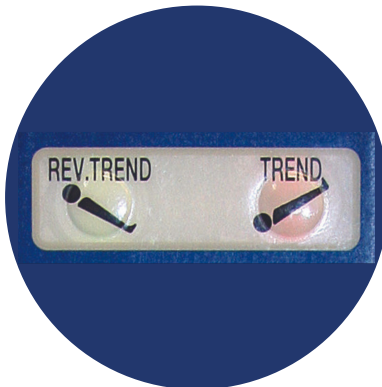
Back lit one-touch positioning functions include Trendelenburg, tilt, and more