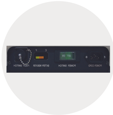
Battery life/diagnostic indicator