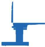
90° Back Up