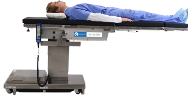
Lower Body Imaging