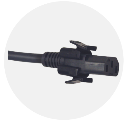
Easy to use clip style power cord