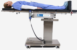
Upper Body Imaging