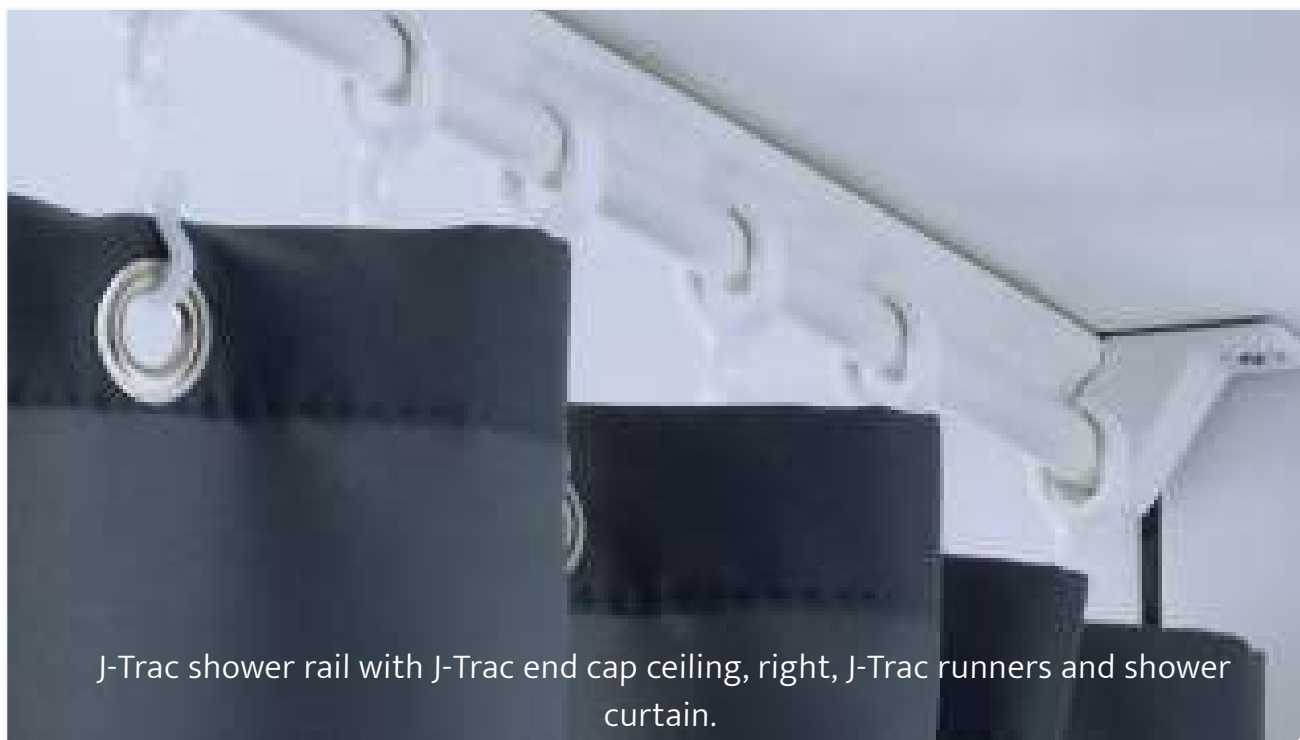
J-Trac shower rail with J-Trac end cap ceiling, right, J-Trac runners and shower curtain.

This product is patented and tested at RISE/SP in Sweden. Made in Sweden.