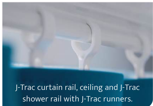
J-Trac curtain rail, ceiling and J-Trac shower rail with J-Trac runners.