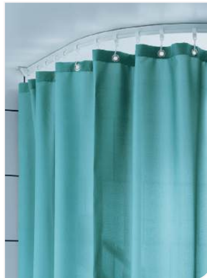
J-Trac shower rail 90° with J-Trac runner.